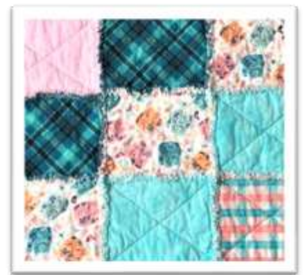
Turquoise Cat Blanket