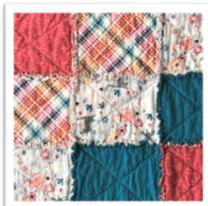
Rust/Plaid Cat Blanket