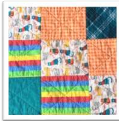
Rainbow Cat Blanket