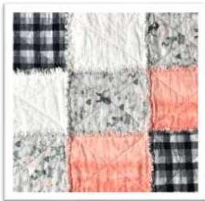
Gray/Peach Cat Blanket