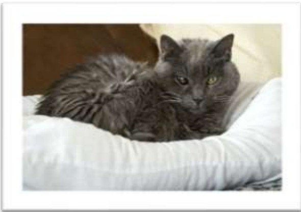
👑👑 Ebony 👑👑

Ebony is a 19 year-old female who was surrendered to the shelter by her family who had her since she was a kitten. They surrendered her because her stools were loose and bloody. Upon coming to JSCR, the vet prescribed probiotics which cleared up her stools immediately. Ebony is now living comfortably at her new forever foster home, where she is treated like the princess that she is. Ebony returns the favor by warming her family's laps and serenading them with soft purrs.