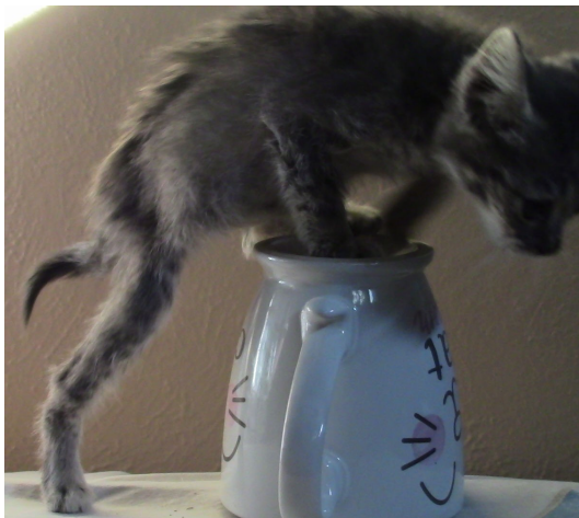
Lilo after rescue