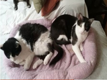
Sinny & Buttercup

With the ever increasing number of cats needing help, we are looking for new fosters! We have two foster programs: