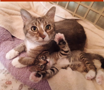
Rosie & Rory

This year has been a very busy year for us! We took in 56 cats in total this year!! Including five cats from Chicago, one from California, and one from Arizona. This is the largest number of cats we have ever received, and we are stretched beyond our limit. We need to expand in order to assist the many senior cats who need our help. We are seeking property that will allow us to grow our senior cat sanctuary for years to come. To make this happen, we created the Felix Legacy Fund.