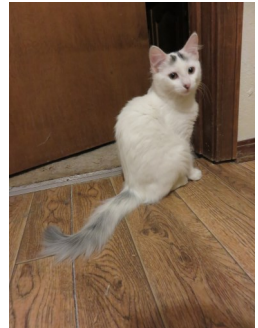
Panda, one of the youngest cats we helped this year.

ship, food and litter to your forever foster. If something happens in your life and you are no longer able to continue being a forever foster, we take the cat back. If that sounds like something you would be interested in, give us a call at 505-220-3528 or cats@g.com for more information.