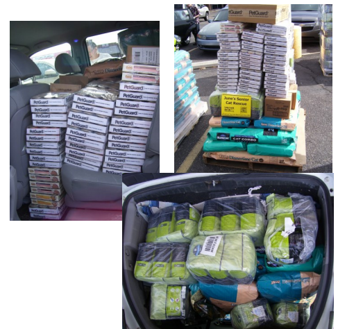
Some of the donated food we received.

Please shop at Long Leash on Life and show them how much we appreciate them. They are located at 9800 Montgomery, ABQ, 87111.