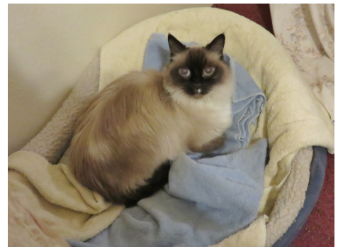
BB, 13 years old, looking handsome in his bed. BB is available for adoption.