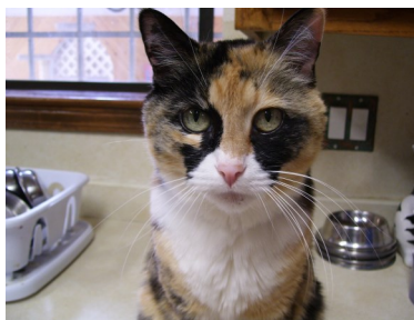
Luana—adopted in 2016