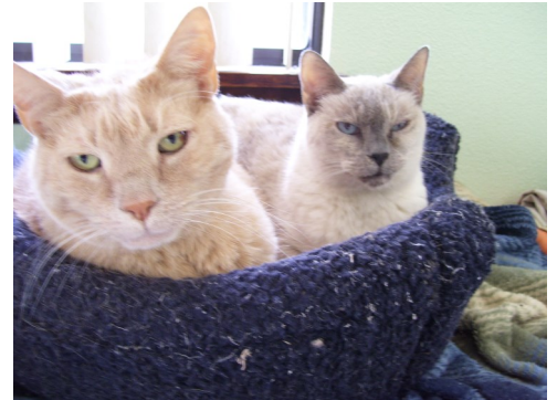
Ember and Wonderful