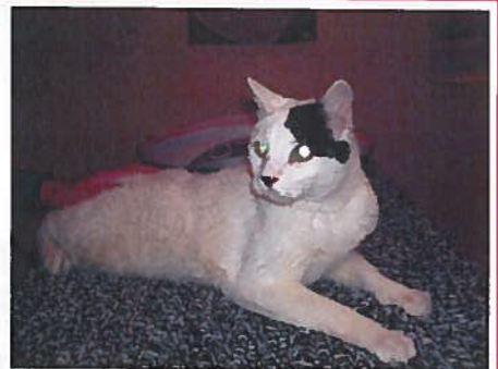
Max, 13 years old, at the vet's