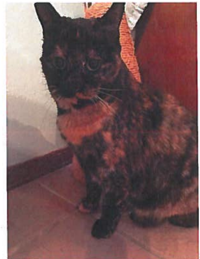
Momma, 12 years old