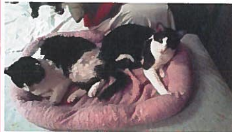
Sinny and Buttercup napping together