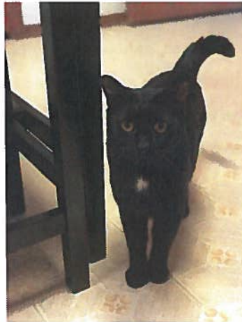
Ziggy, 7 years old