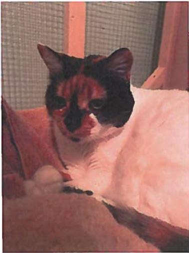
Callie, 13 years old